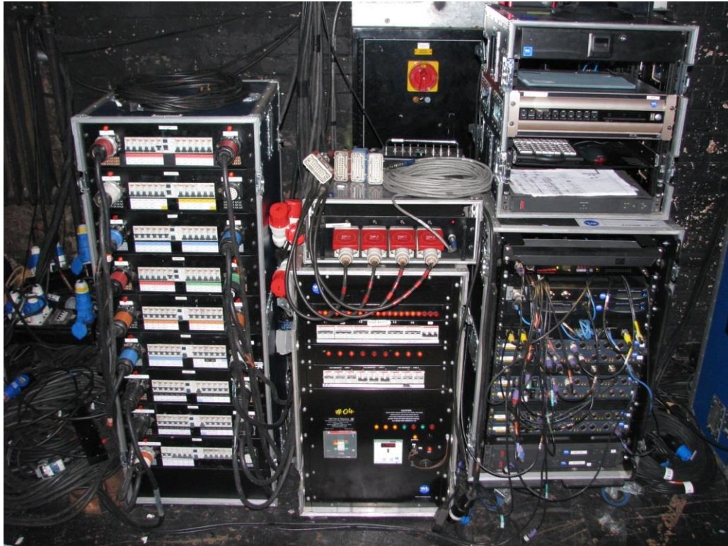
Mains distribution equipment backstage. The rack on the left is a 108 x 10 Amp channels of single phase power distribution, in the centre is a 16 way three-phase distribution unit, the rack on the right is control data distribution.

The starting point of the electrical design is really concerned with the safe loading of these distribution systems when they are hooked up to the power supplies available in the theatres that the show is visiting, the electrical characteristics of which are often unknown. Nick explains: