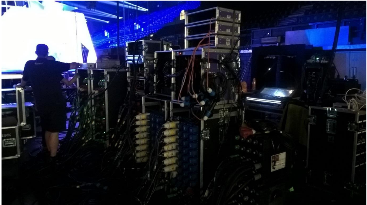
Almost theatre, but not quite – backstage lighting dimming, distribution and control for the BBC EU Referendum debates in Wembley Arena.