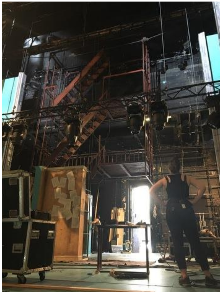
Different scenic and technical elements jostling for position halfway through a show build.