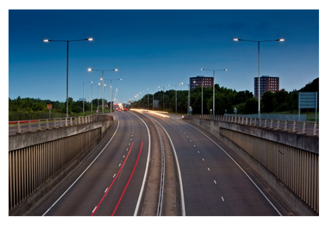
Figure 2 Example of lighting: a road in a residential area