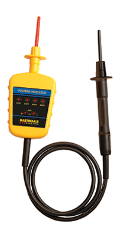
A voltage indicator from Martindale Electric

Another primary consideration is whether installers and maintainers have the necessary skills and experience with d.c. installations of the kind being considered. Test equipment and faultfinding practices differ slightly with d.c. circuits; appropriately-rated test equipment must be used. Those using the equipment need to be aware of the limitations of some a.c. equipment settings on d.c. systems. For example, a multimeter on an a.c. setting may read zero if used on d.c. circuits, giving the false impression of absence of voltage. It is important to ensure that voltage testers/indicators used for "proving dead" are suitable for both a.c. and d.c. operation.