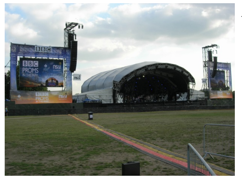
BBC Proms in the park, with the stage in the middle and large video walls flanking it either side, displaying the BBC proms logo. The black hanging columns are speaker stacks.

To illustrate the diversity, many years before the Arab spring I was part of the lighting crew putting on a son-et-lumiere for Colonel Gadaffi in Libya. In complete contrast, a couple of months later I was part of the lighting crew working on Miss World in the Seychelles. We had time there to explore the island in between rehearsals and it was quite relaxed. So you just never know what the next phone call might bring or where it will take you.